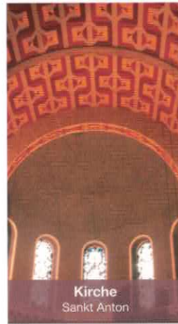
Kirche Sankt Anton