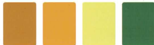
Ockergelb Ochre Yellow C-651-3 HBZ | LV 30