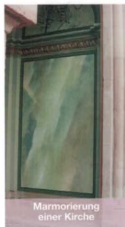
Marmorierung einer Kirche