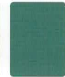
C-247-3 HBZ | LV 18