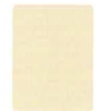
C-103-3 HBZ | LV 83