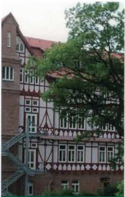
Hermann-Lietz-Schule Haubinda, Thüringen