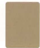
C-319-3 HBZ | LV 37