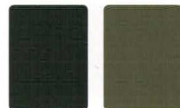
Schwarz Black C-655-3 HBZ | LV 3