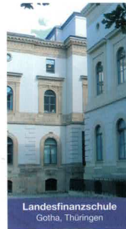
Landesfinanzschule Gotha, Thüringen