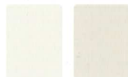
Weiß White C-102-3 HBZ | LV 90