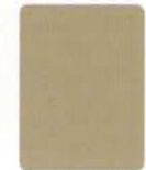
C-316-3 HBZ | LV 40